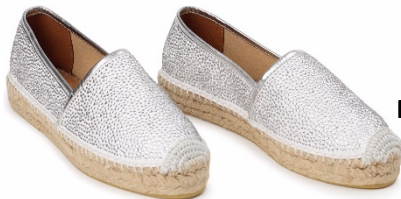
Penelope Espadrille - $ 85 - White

Come on over and see them... they're BEAUTIFUL!!!!