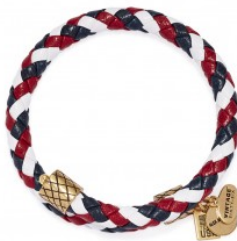
Red Whit & Blue Braid - $ 48