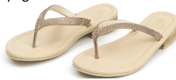
Sofie - $ 70 Champagne and Clear