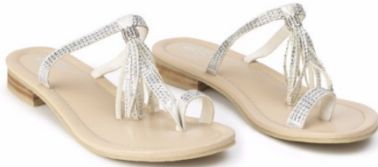
Janine Tassel Flat - $ 90 Clear and Hamatite