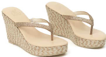
Sofie - $ 70 Champagne and Clear