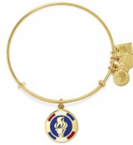
Team USA Bangle $ 38

A mix of willpower and strength, the energy of the Olympic Games is competitive, determined, and heartfelt. Inspiring achievement, the Olympic Games opens us up to the possibilities in persistence. Encouraging the wearer to reach higher, live stronger, and love greater, adorn yourself with the Team USA Collection Pieces as a symbol of America's extraordinary patriotism.