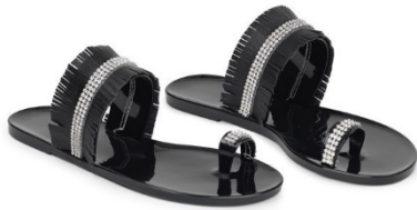
Melinda Jelly Fringe - $ 35 Beige and Black