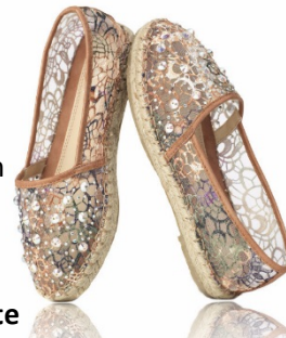
Camille Espadrille - $ 85 - Peach