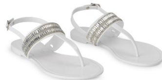
Helena Jelly - $ 35 White