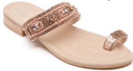
Arrienne - $ 95 In Jute, Clear, Hematite and Champagne

Savi Resort Wear was created to enhance the beauty of the modern woman with its chic and sophisticated styles to be worn from yacht to poolside. For Savi Resort Wear, luxury means not only high style but high quality and manufacturing excellence. Each piece is hand made from the stitching of the fabric/leather to the embellishment of the crystals and stones.