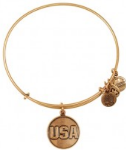
USA Charm Bangle - $ 32

We also have in stock, the Olympic bracelets: