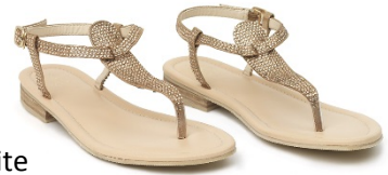
Gladiator - $ 75 Aquamarine, Diamond, Champagne and Hemetite